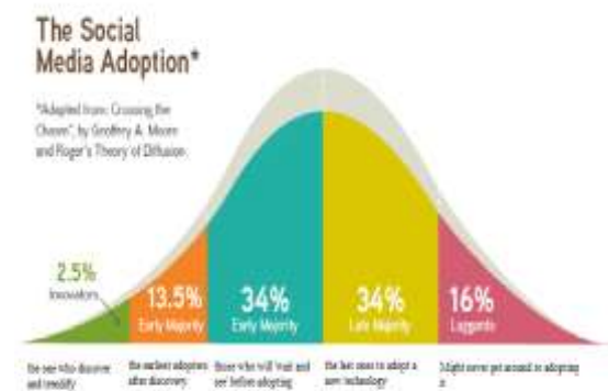
Fig: Social media adaptation [8]

Social media is the new buzz area in marketing that includes business, organizations and brands which helps to create news, make friends, make connections and make followers. Business use social media to enhance an organization's performance in various ways such as to accomplish business objectives, increasing annual sales of the organization. Social media provides the benefit as a communication platform that facilitates two way communication between a company and their stock holders [6]. Business can be promoted through various social networking sites. Many of the organization promotes their business by giving advertisement on the social media in order to attract maximum users or customers. Customers can connect and interact with business on a more personal level by using social media. If an organization has established a brand, social media may help this organization to develop the existing brand and give the business a voice. With the help of social media organization can make their strategy to promote their organization.